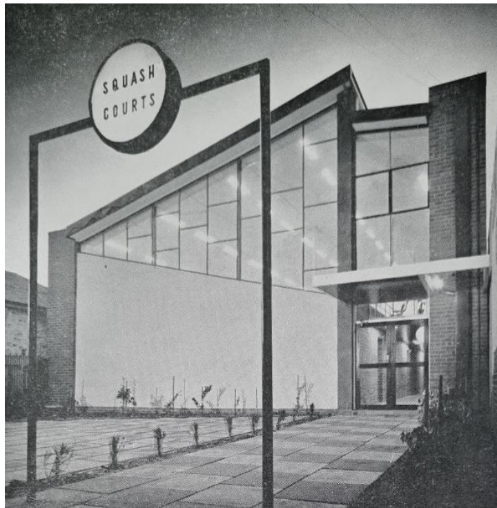
Fremantle Squash Courts (The Architect June 1960 p.20)