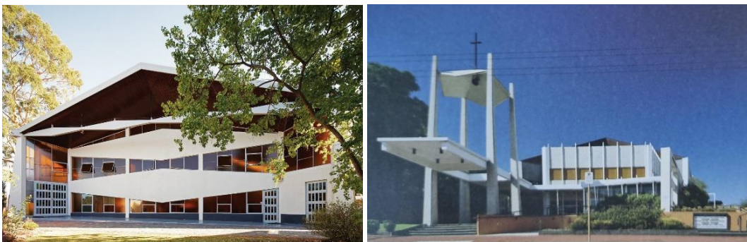
1960 Church of St Cecilia Floreat, 1962 Church of St Peter Bedford (Anderson & Murray, pp.58, 66).

Jones was also noted for his many ecclesiastical projects, and completed a total of six churches for the Catholic Church. The first was the 1958 Church of the Holy Family at Como. In 1960, the Church of St Cecilia, in Kenmore Crescent Floreat, departed from the typical cruciform plan. Instead, St Cecilia's pentagonal form was based on a total of ten planes (five wall planes and five roof planes), which symbolized the Ten Commandments and the sacrifice of Jesus Christ.